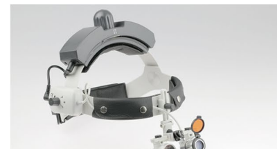
Cordless HL8300 Headlight combined with SLE Binocular Loupes