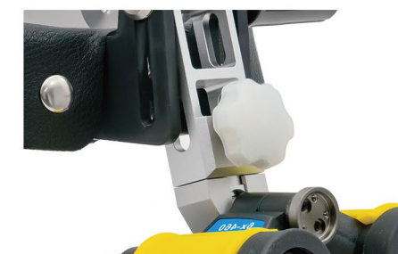
One lock lever