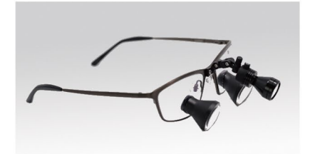
HL8200 Headlight combined with SLT Binocular Loupes (Titanium Frame)