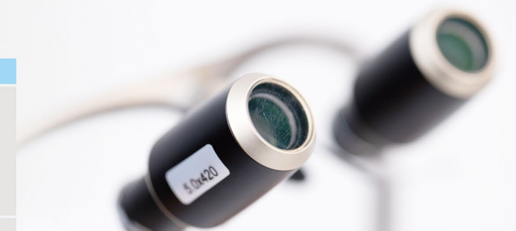
All lenses are multi-coated and anti-reflective, combining with infinity corrected optical system.