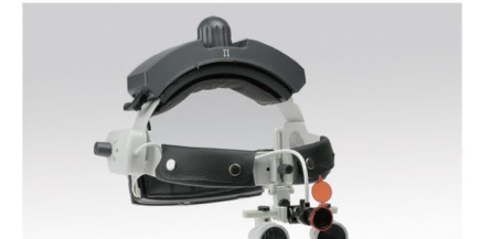
Cordless HL8200 Headlight combined with SLE Binocular Loupes