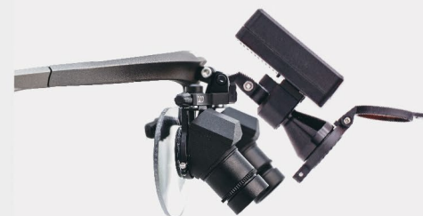
HL8260 Headlight combined with DFK Binocular Loupes