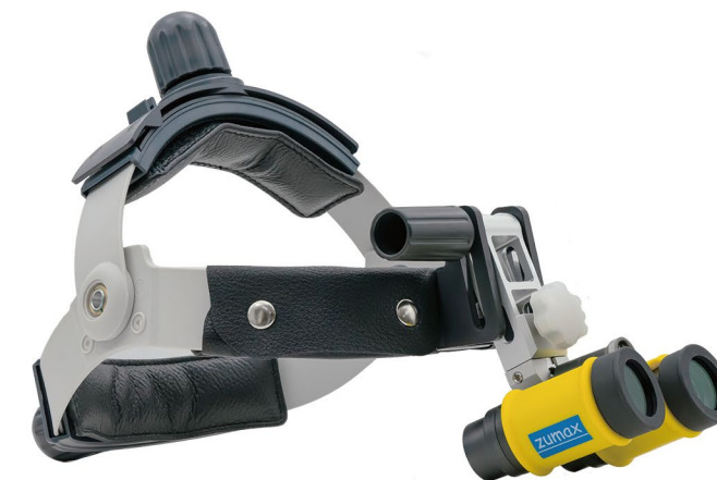
SLH Binocular Loupes