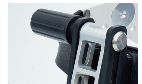
Vertical displacement knob