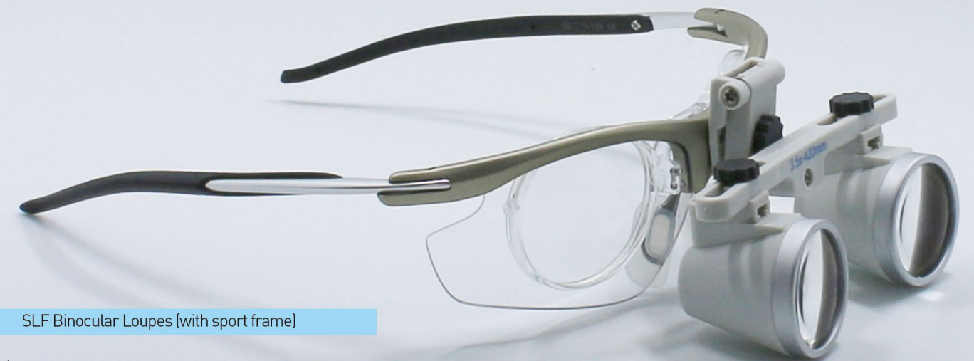
SLF Binocular Loupes (with sport frame)