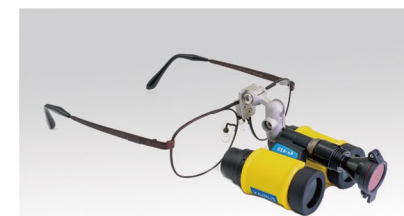
HL8200 Headlight combined with SLE Binocular Loupes (Kepler Optics)