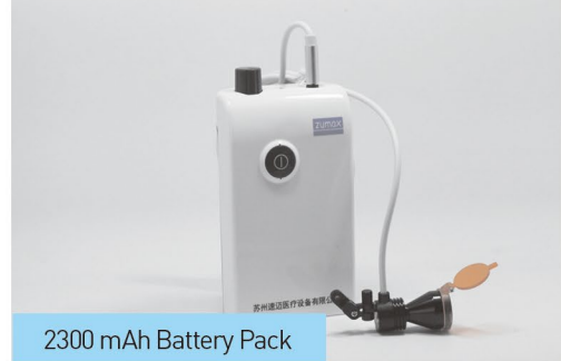
2300 mAh Battery Pack