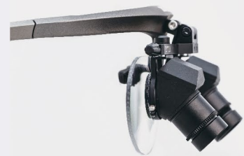
DFK Binocular Loupes