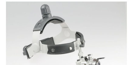
HL8300 Headlight combined with SLH Binocular Loupes