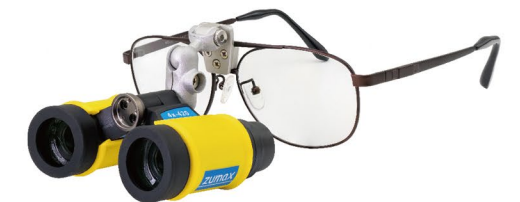
SLE Binocular Loupes