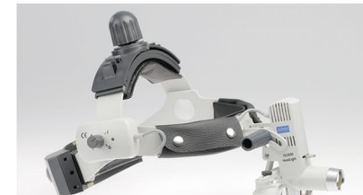
Cordless HL8000 Headlight combined with SLE Binocular Loupes