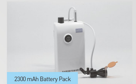
2300 mAh Battery Pack