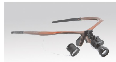
HL8200 Headlight combined with SLT Binocular Loupes (Sport Frame)