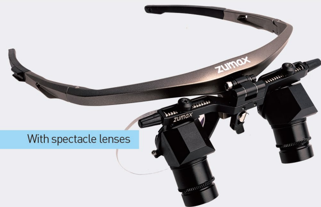
With spectacle lenses