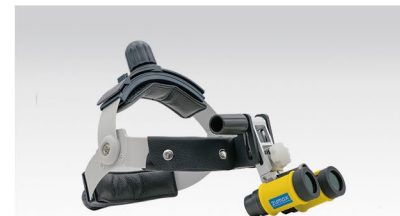
HL8200 Headlight combined with SLH Binocular Loupes (Kepler Optics)