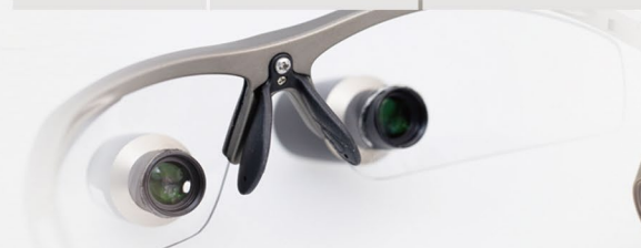
Soft silicone nose pad.