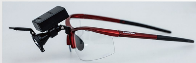
Can be installed on the glasses frame