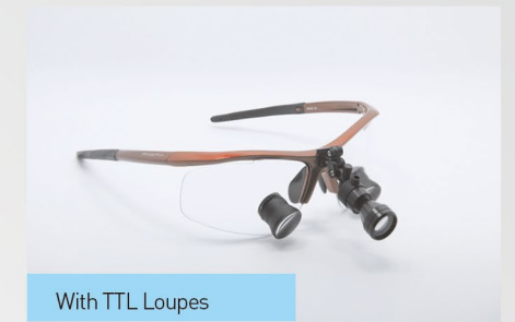
With TTL Loupes