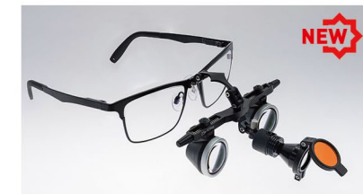
HL8200 Headlight combined with SLK Binocular Loupes