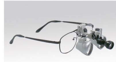
HL8200 Headlight combined with SLE Binocular Loupes