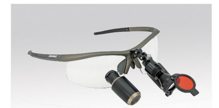
HL8200 Headlight combined with SLT TTL Binocular Loupes (Kepler Optics)