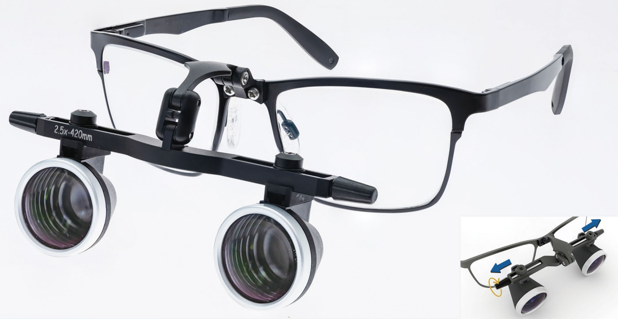
SLK Binocular Loupes (with sport frame)