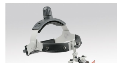
HL8200 Headlight combined with SLH Binocular Loupes