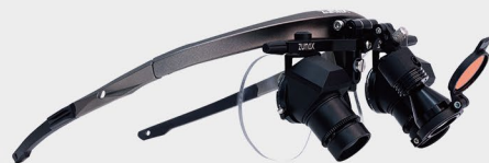
HL8200 Headlight combined with DFK Binocular Loupes