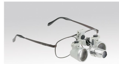
HL8300 Headlight combined with SLE Binocular Loupes