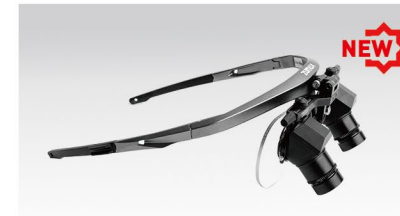
HL8200 Headlight combined with DF-series Binocular Loupes (Deflection type)