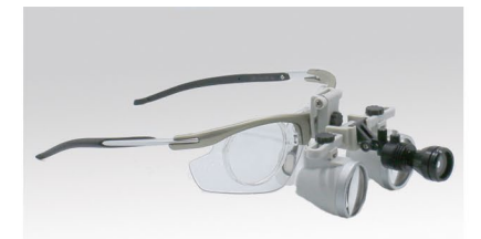
HL8200 Headlight combined with SLF Binocular Loupes