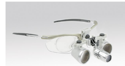
HL8300 Headlight combined with SLF Binocular Loupes